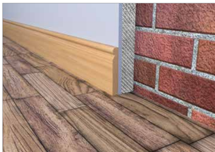
Spacetherm Wallboard skirting detail

For other thicknesses, or for U-value calculations for your project, please contact Technical Services on 01250 872261 or technical@proctorgroup.com