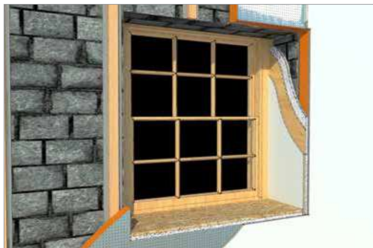
Image showing Spacetherm WRB applied internally to a reveal on an existing external wall structure.