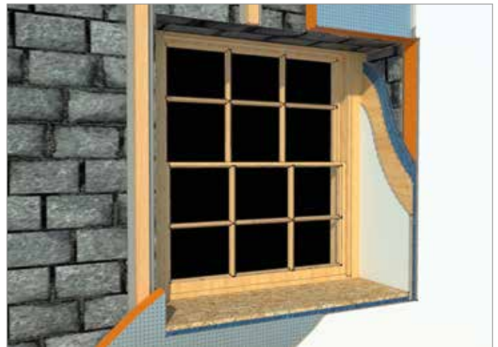
Image showing Spacetherm WRB applied internally to a reveal on an existing external wall structure.