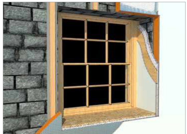
Image showing Spacetherm WRB applied internally to a reveal on an existing external wall structure.