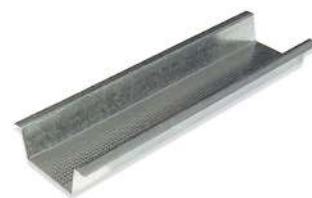
PhonoClip® Resilient Bar